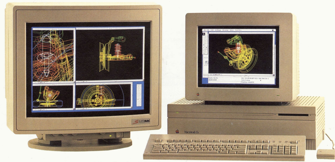
MicroStation Mac shown on a dual-screen hardware configuration.

MicroStation Mac exemplifies the most complete functionality of any CADD package available for the Macintosh today. More than 450 viewing and drawing functions are supported; 3D is fully implemented. In fact, no other competing product rivals the capability of MicroStation Mac to concurrently