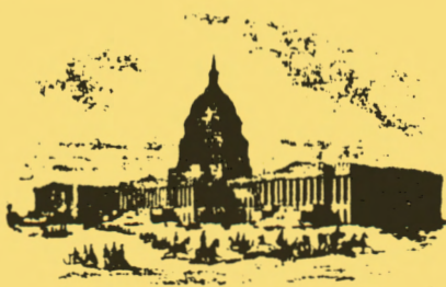
THE CAPITOL STORE

BACK ISSUES AVAILABLE - If you would like to "catch up" on back issues of the Eugene PCjr Club Newsletter, just drop us a line. The "masters" are in the files, at least as far back as May 1986. We'd like to get reimbursed for the Xeroxing and postage, so the cost will be about .90 each. We can Xerox copies of earlier ones, but as they are not the "masters," the quality isn't as good. Let us know which ones you need.