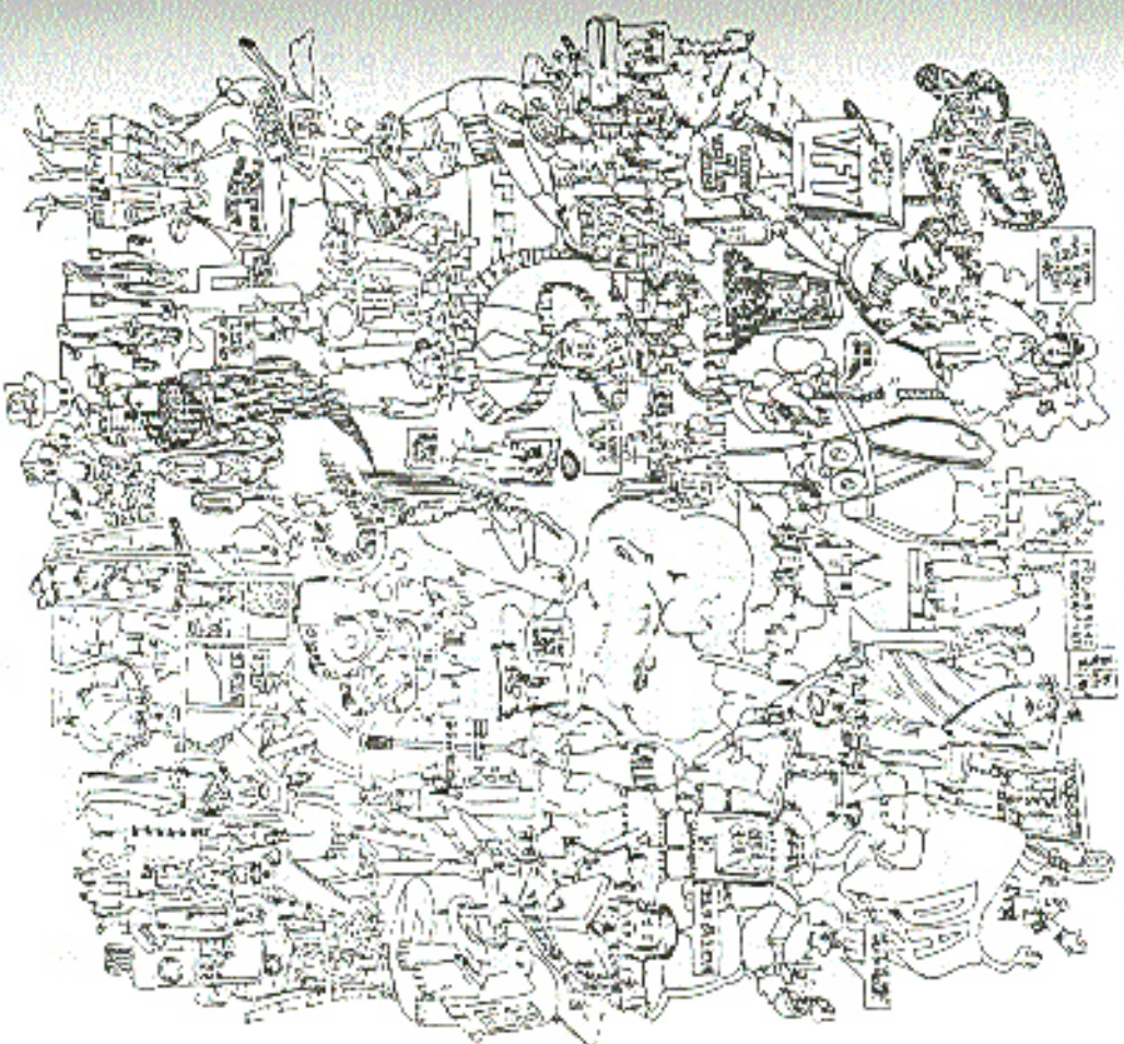
ARTWORK BY J.R. "BOB" DOBBS

Also, this article was written mainly from first-hand experience and information gained from maintenance technicians, test boards, as well as technical literature, so it is as accurate as possible. Keep in mind that it is mainly centered upon the area served by Pacific Telephone, so there may be some differences in the loop plant of your area.