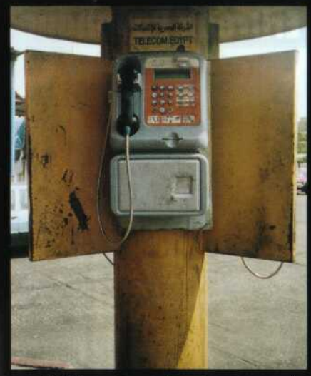
An old Telecom Egypt phone found at a major bus station.