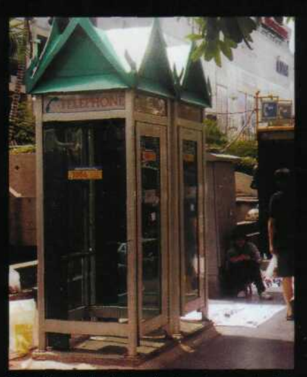
From Bangkok, the booth alone is a spectacle to behold.