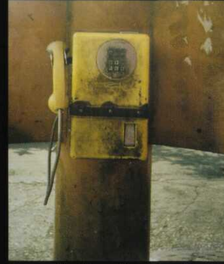
An even older Telecom Egypt phone that takes coins and could really use a good scrubbing.