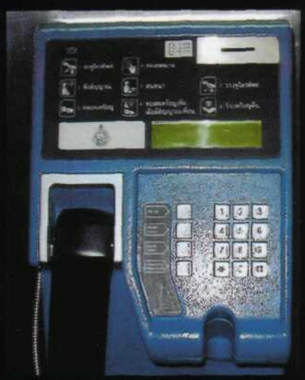
This is as bright and as blue as they come.