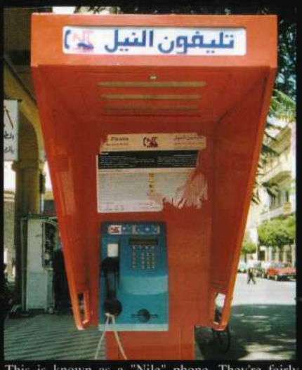
This is known as a "Nile" phone. They're fairly popular and widespread and they use prepaid cards.