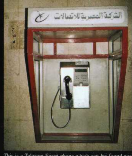
This is a Telecom Egypt phone which can be found near phone company buildings and a few other places. Even in Egypt, phone companies seem to like using that silly swirl symbol that seems to dominate the technology world.