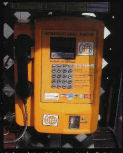
A phone designed for international calls that takes all kinds of credit cards.