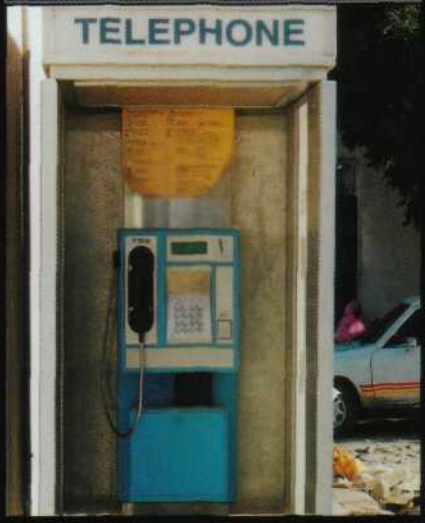
Found in a small town called Keren, famed for its sacred baobab tree, its walled camel market, and its dwindling population of landmines.