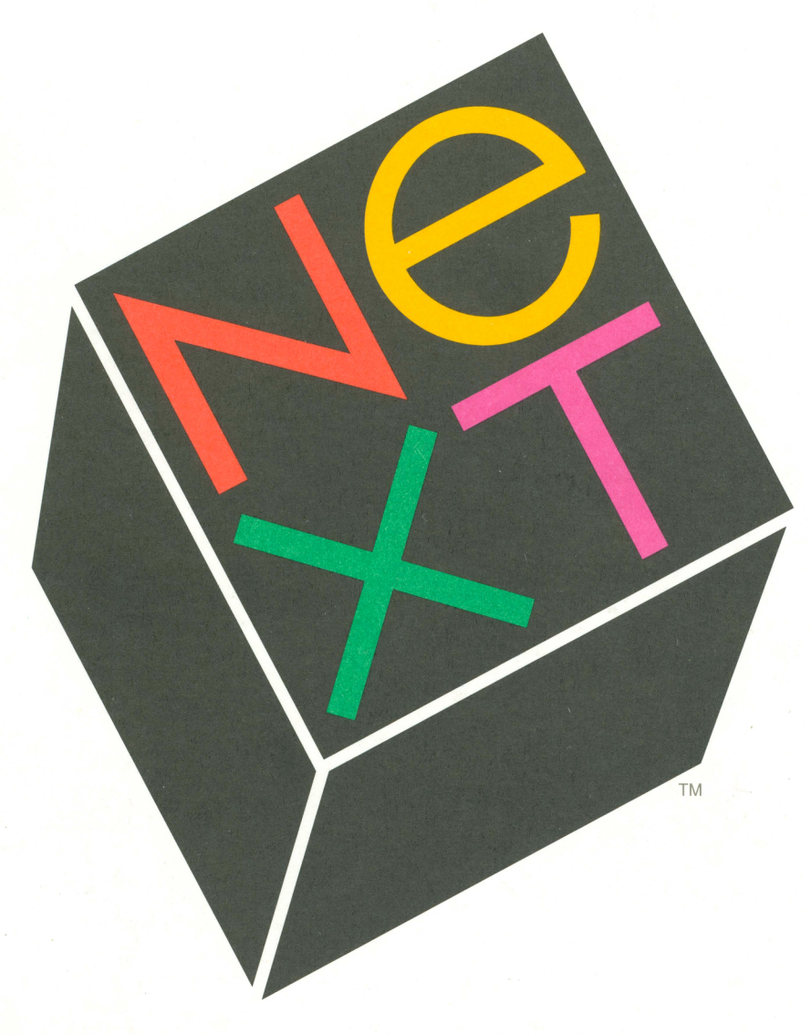
Third-Party Programs and Products