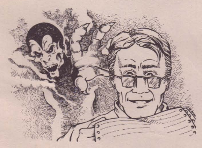
"I don't think we need to run any back-up today."