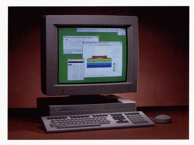
VT1300 terminal displaying DECview3d, Calculator and DECwindows mail.

The VT1300 color X Window terminal provides the display characteristics you expect in a workstation. Its high resolution monitor has a display of 1280 x 1024, a 66 Hz flicker-free refresh rate and 8 color graphics planes. And the 90 nanosecond CVAX processor and its graphics co-processor yield unsurpassed graphics performance. Together these features give you graphics displays of exceptional clarity, at exceptional performance levels.